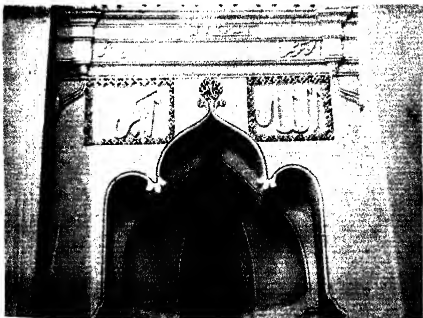
SHITE INSCRIPTION BELOW THE DOME (Chap. VII)